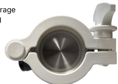
SS316L surface exposed to process